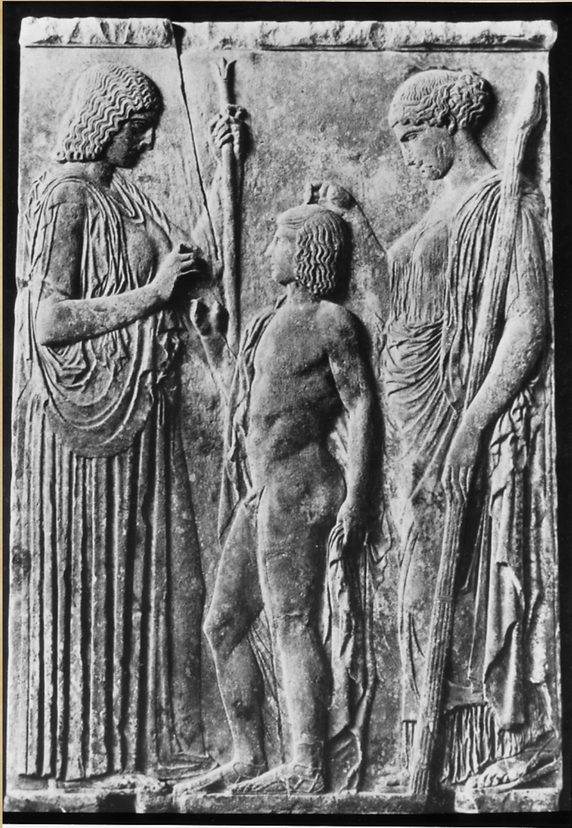
Demeter & Persephonê & Triptolemus